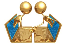
Shuswap Gathering Meeting.

If you are interested in Volunteering please feel free to attend the meeting.